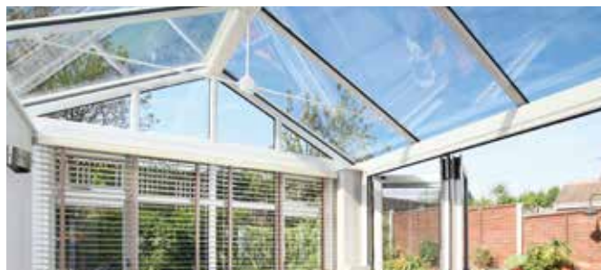
SMARTGLASS® Ultimate - A Technological Benchmark