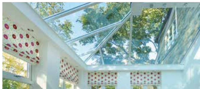
SMARTGLASS® Plus+ - Enhanced Performance